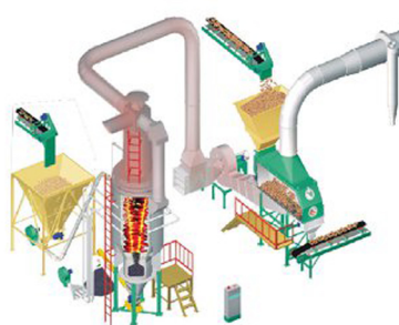
Typical Installation of CHF with Fluidized Bed Dryer