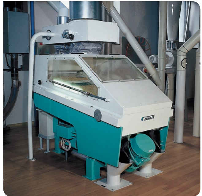
MTSD destoner for efficient separation of stones and pebbles.

The MTSD destoner is available in three different sizes with a throughput scalability of 2 to 6 t/h, 6 to 12 t/h, or 12 to 22 t/h. It can thus be flexibly adjusted to individual space situations.